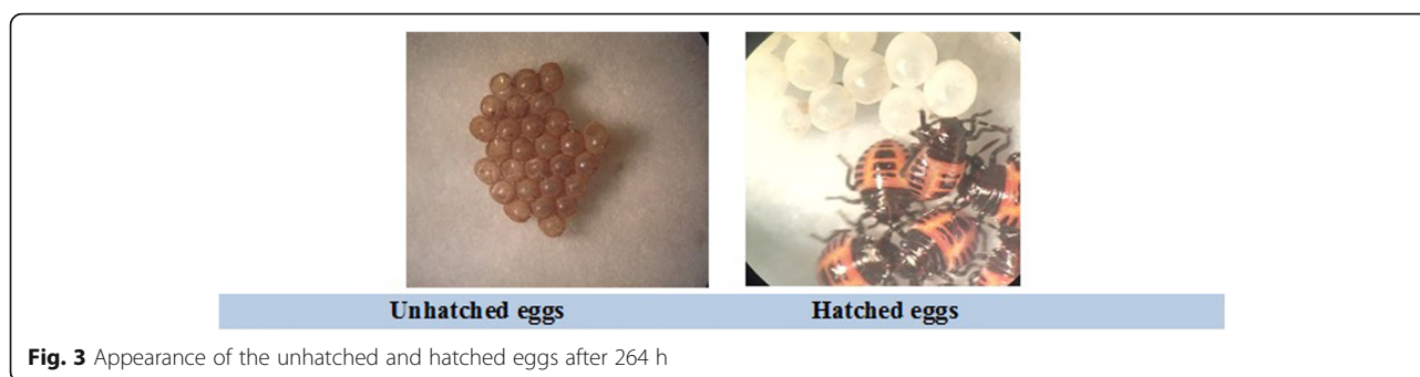
Fig. 3 Appearance of the unhatched and hatched eggs after 264 h

100.00%), B. thuringiensis kurstaki (FD 16 (91.67%), FD 51 (90.83%)), B. atrophaeus (FD 17, 86.67%), B. cereus (FDP 8, 85.00%), B. sphaericus (FD 49, 77.50%), and B. brevis (FD 1, 95.00%) strains were effective against H. halys nymphs.